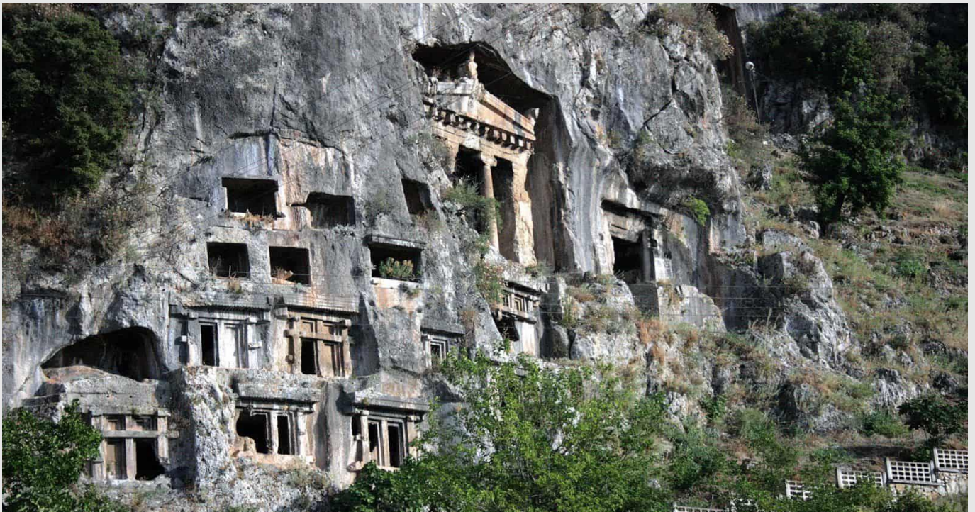
Telmessos Ancient Lycian Rock Tombs in Fethiye

Fethiye is a natural harbor city in the western Mediterranean, known for its magnificent natural beauty and ancient Lycian towns. Ölüdeniz, considered Turkey's most beautiful beach, is nearby. Fethiye is a popular starting point for yacht cruises. Its turquoise waters, a blend of blue with a hint of green, are reminiscent of the stunning Turkish tile work. The most beautiful shade of blue graces the waters of Ölüdeniz, especially at sunset.